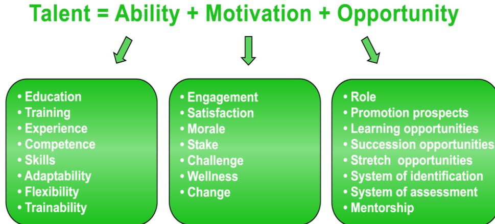
Fig1. Components of Talent

There is a war going on, and many healthcare organizations are fighting it and losing. It is the war to attract and retain great talent. The need to enhance the success of the organization lies in the heart of the management of the firm. There are several resources to achieve this which include money, men and the machine, but the most important of these resources is men. Organizations know that they must have the best talent in order to succeed in the hypercompetitive and increasingly complex global economy (Stahl et al., 2012). In a competitive marketplace, talent management is a primary driver for organizational success. Broadly defined talent management is the implementation of integrated strategies or systems designed to increase workplace productivity by developing improved processes for attracting, developing, retaining and utilizing people with the required skills and aptitude to meet current and future organization's needs (Hamidi, Saberi & Safari, 2014).