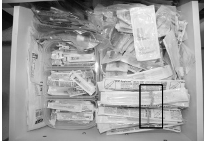
Fig2. Keeping IV catheters tight with an elastic band

I guess the space is small for all materials they have there, so they end up storing the wrong way. That elastic band, I've talked about it many times in all units. Because it tightens and contaminates the whole material. It is because of the space and tying them the drawer becomes more organized. (P2)