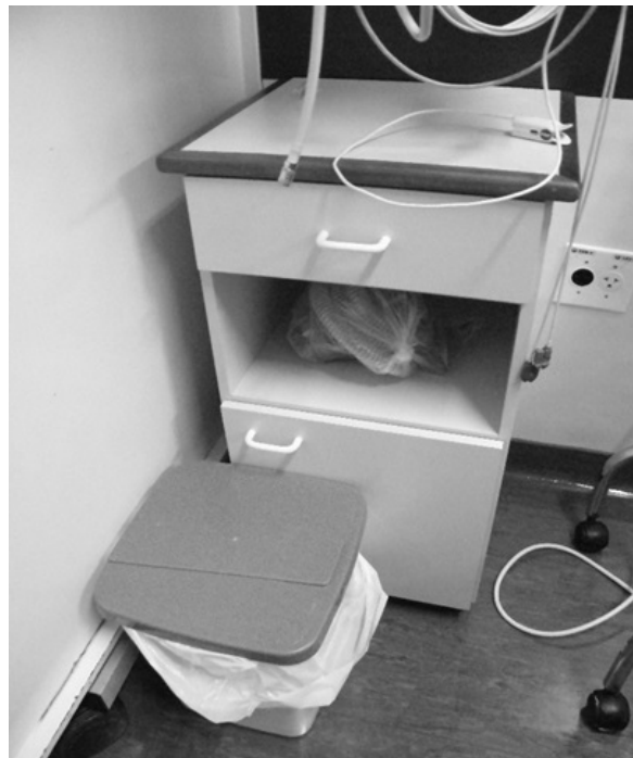
Fig1. Patient’s bedside cabinet

Spatial barriers presented challenges to medication safety in a variety of ways. According to one participant, the size of the patient’s bedside cabinet was insufficient. The nurse argued that it was necessary to work around this deficit by balancing the medication tray on top of the patient during medication administration (Figure 1):