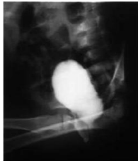
Fig10. VCUG: No reflux post heminephroureterectomy