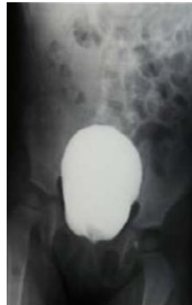
Fig6. Post ureterocele puncture VCUG: No Reflux

While the two with duplicated system were treated, one case with puncture of the ureterocele and ipsilateral heminephrectomy and the other case with opened excision (marsupilization) of huge ureterocele and ipsilateral heminephroureterectomy, Fig. (7, 8, 9, 10) (Reconstructive surgery). As we mentioned in the literature, we chose the suitable options of treatment for each case. They remained asymptomatic and required no further treatment during follow up period of 24 months.