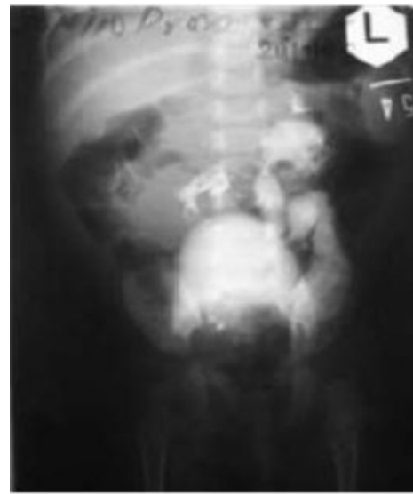
Fig8. IVU: Rt. ectopic ureterocele with bil. duplication system.