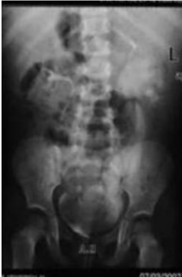
Fig1. IVU: Rt.ectopic duplex ureterocele

This is not mandatory, but if performed it may reveal a negative shadow of the ureterocele within the bladder, a drooping lily sign in the kidney (down ward displaced lower pole), a lower pole collecting system with missing upper pole infundibulum and a laterally displaced lower pole ureter that loops around the dilated upper ureter in the pelvis .Fig. (1).