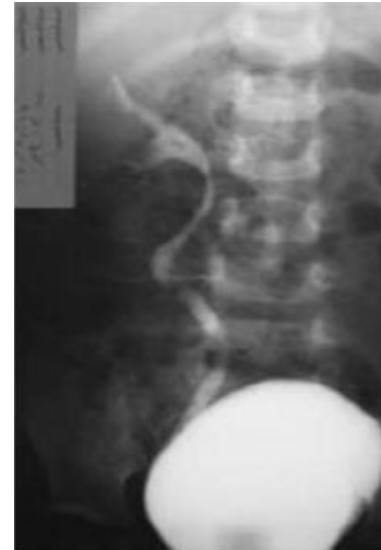
Fig3. VCUG Post Puncture of ectopic R ureterocele: Ipsilateral. R VUR