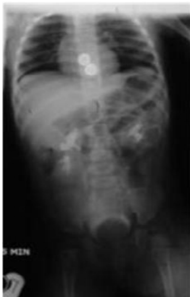
Fig4. IVU: Rt. single ureterocele

Voiding cystourethrogram can demonstrate the size and location of the ureterocele as well as the presence or absence of VUR .Reflux into the ipsilateral lower pole is common, Pfister and colleagues noted an incidence of VUR of 49% .Reflux may also be seen in the contralateral system if the ureterocele is large enough to distort the trigone and the opposite ureteral submucosal tunnel, as also seen in our two cases of duplex ureteroceles associated with bilateral reflux (Fig.1, 2, 3). The remained two cases were with single system and not refluxing. Our two cases with single system were treated by endoscopic puncture alone (Fig. 4, 5.6).