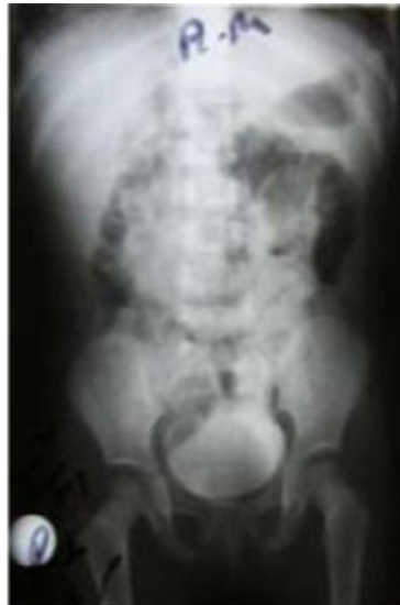
Fig2. VCUG: Rt.ureterocele Lt.VUR