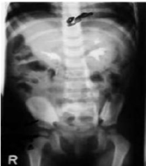
Fig9. IVU: Normal urogram Post Rt. heminephroureterectomy